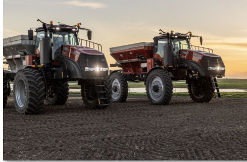
Case IH – Raven Industries: first autonomous spreader Trident 5550.