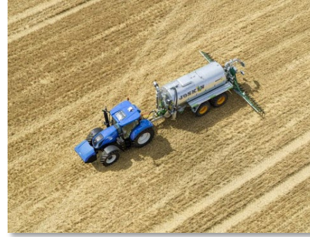
T6 Methane Power Stage V.

We believe that Innovation , Sustainability and Productivity shall guide us to achieve a circular and more sustainable agriculture.